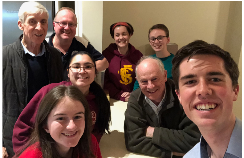
Meet the residents of Marist House Fitzroy on pages 2 and 3.